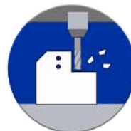
Milling Pieces up to 6" thick