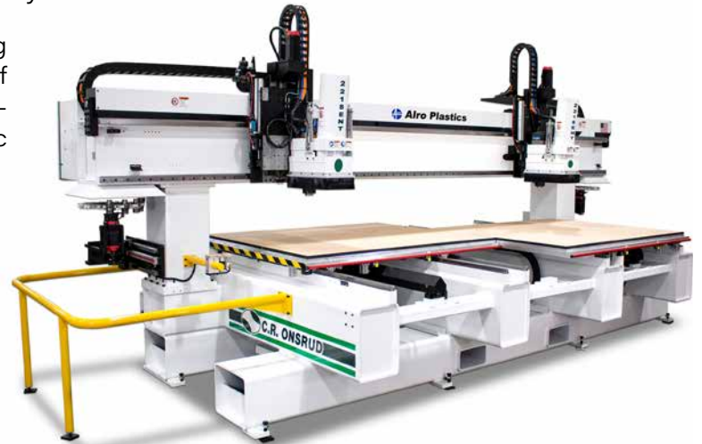
Pictured, twin table CNC router with dual heads and automatic tool changers