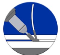
Welding Hot Gas & Extrusion